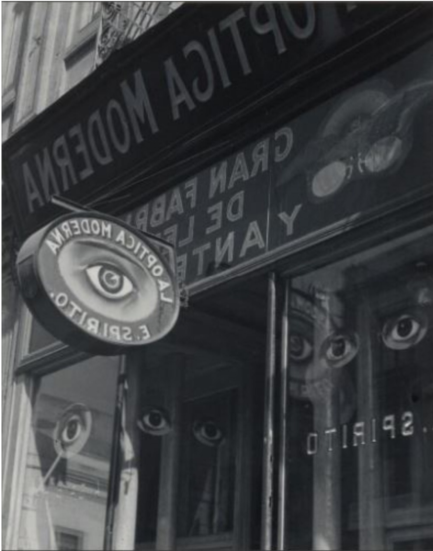
Figure 4. Manuel Álvarez Bravo, “Parábola óptica” (1931)

Atget. 24 Álvarez Bravo learned from Atget that, as Horacio Fernández puts it, “life is arrested” in shop windows and in photographs, making “photographic images of shop windows, always still-lives, doubly latent, bringing them close to the courses of the uncanny, that awful sensation which affects well-known, familiar things as soon as they leave their customary context” (256). In Atget’s photographs, we often experience the uncanny because we see traces of a human figure in the reflections of shop windows, an ethereal presence caused not by manipulating the negative but simply as the result of a person passing by on the street during a slow exposure. Álvarez Bravo’s photograph alludes to this