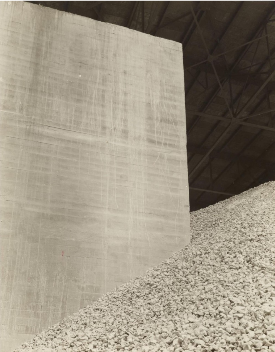
Figure 3. Manuel Álvarez Bravo, “La Tolteca” (1931)

The photograph “La Tolteca,” like “Colchón,” inverts apparent meaning to draw out the ironic truth of industrialization projects in Mexico. Before entering into a more detailed interpretation of the photograph, however, I should explain the peculiar occasion for which Álvarez Bravo produced this work. In 1932, this photograph won an art contest sponsored by the Tolteca 20 Cement