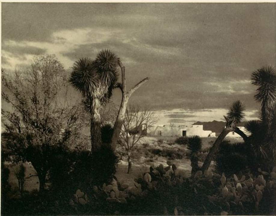
Figure 5. Paul Strand, “Near Saltillo” (1932)

haps Strand yearned to capture a cultural and natural Mexican identity that had not yet been corrupted by modernity. And yet, if “Near Saltillo” resembles picturesque photography insofar as it includes architecture and flora specific to that region (e.g., the prickly pear cactus, the adobe house), the composition of the picture does not present these elements as instances of local color, as recognizable examples of “Mexicanness.” Strand places the adobe house at the focal point of the picture, but the photograph does not reveal striking architectural details of the building. The stark contrast of light and shadow effectively reduces the house to bare white walls and a black doorway. The prickly pear cactus, likewise, figures prominently, but the shadow cast on the cactus by the clouds means that we cannot recognize the intricate texture of the plant, as we might in a Weston picture. Moreover, the cactus appears to constitute a thorny fence that prevent us from approaching the house. 30 Rather than give us a recognizable image of Mexico that one could hang on the wall, the picture simultaneously draws us in and keeps us at a distance. Katherine Ware has rightly argued that the first two pictures of Photographs of Mexico “provide a context for the human figures that inhabit the portfolio” (115). But this context does not make the human figures fully familiar; it does not construe them as consistent