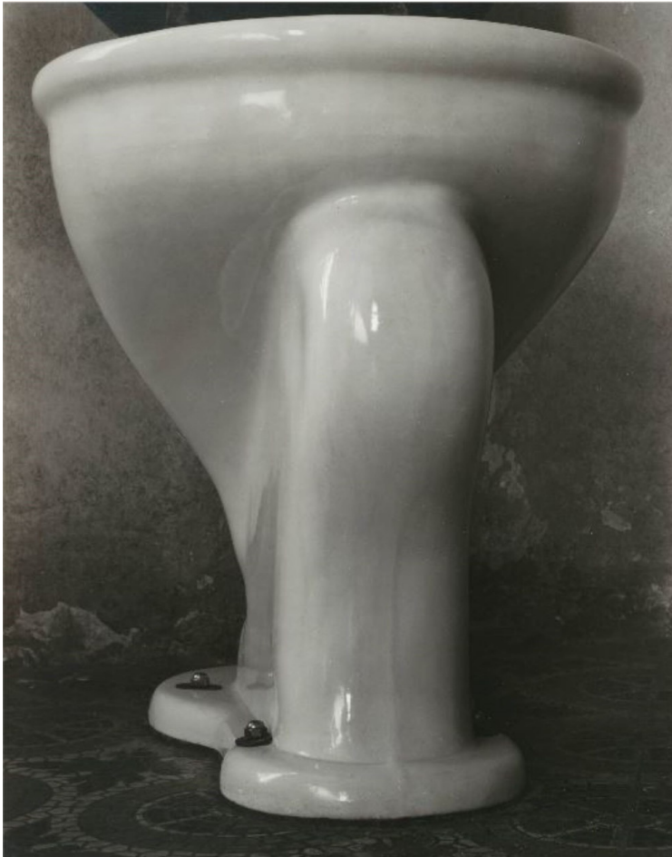
Figure 1. Edward Weston, “Excusado” (1925)

come to characterize his mature work. We might say that he was searching for inspiration when he went to Mexico, a vivid, exotic land that had not yet lost its authenticity to modern culture. But if the trip to Mexico put Weston in touch with nature, it did not lead him to take photographs of the picturesque local color because he had definitively abandoned the pictorialist aesthetic. “I might call my work in Mexico,” he once wrote, “a fight to avoid its natural picturesqueness.” 12 At the same time, Weston did not seek out the abstract forms of factories and smokestacks that had preoccupied him when visiting Ohio a year before the trip to Mexico. In a context overflowing with unique forms, but having proscribed for himself striking natural and industrial scenes, Weston made the surprising choice to spend hours exploring the aesthetic potential of a quotidian object: his toilet.