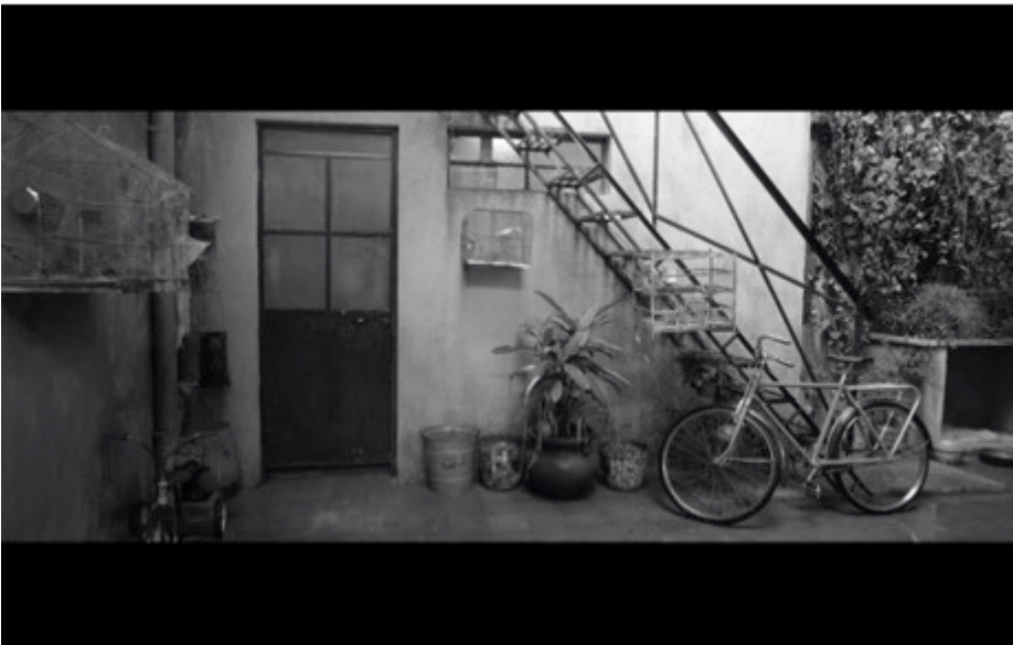
FIGURE 1. Surveillant narration. Cleo has entered the bathroom and the shot lingers, fixed and static. Frame enlargement. Roma (Alfonso Cuarón, Mexico/United States, 2018)

porte-cochère. The stationary camera pans 180 degrees, following Cleo as she walks toward it, passes it, and heads to the bathroom off the courtyard before entering the house. The camera's angle is straight; its height neither high nor low; its location appears to be in the middle of the patio (i.e., there are no signs of a voyeuristic camera, concealed from Cleo's view). This is certainly not a case of ciné-surveillance; and yet, the shot feels not only unsettling but surveillant. When Cleo enters the bathroom, the shot might have been over with the action—after all, the camera has been following Cleo's actions and Cleo had just finished cleaning the driveway and courtyard and left the image. But, instead, the camera—stationary and distant—remains trained on the closed door through which she passed for another 30 seconds, waiting for her to emerge; the “eventhood” of the shot suddenly is cast into doubt. (Figure 1)