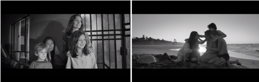
FIGURE 4A-B. Portrait of a family awaiting the arrival of the patriarch (left, 4A). Reconstituted family (right, 4B). Frame enlargements. Roma (Alfonso Cuarón, Mexico/United States, 2018)