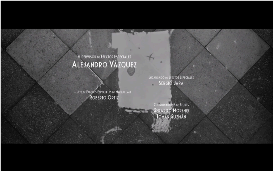
FIGURE 5. From the opening credits: water, both transparent and reflective. Frame enlargement. Roma (Alfonso Cuarón, Mexico/United States, 2018)

from inside the nursery. Her face is pressed up against the window, but the image is obscured as the window's glass is catching the light from behind the camera and reflecting, superimposing—on Cleo face, on the window's glass—the objects and people that belong to the nursery and that are off-screen: the incubators, heat lamps, a nurse. The shots make it difficult to