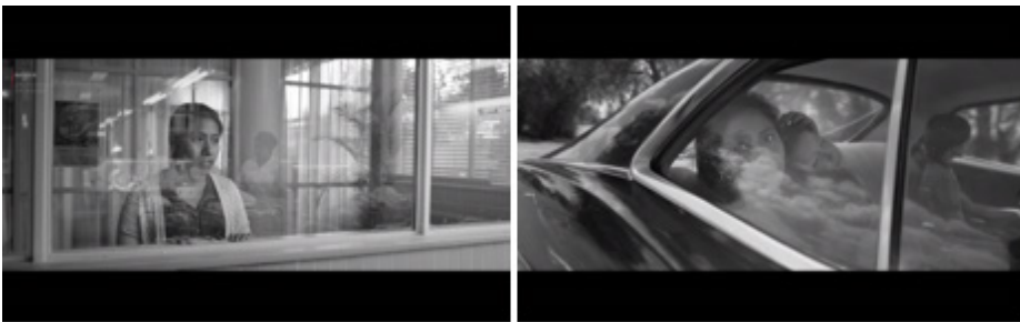
FIGURE 6A-B. Cleo looking into the nursery (left, 6A). Cleo looking outside the car window on the way back from the beach (right, 6B). Windows: both transparent and reflective of off-screen space. Frame enlargement. Roma (Alfonso Cuarón, Mexico/United States, 2018)

see what belongs to the space in front of the camera and what belongs to the off-screen space behind it, and seeing clearly through the window at Cleo is impossible as her face and her dark clothes become especially useful conduits for reflecting what is behind.